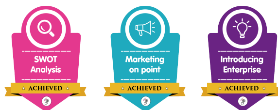
Badges of Gamified Learning Platform

It all boils down to the fact, that the more customized the game application can become, the wider the target group it addresses. As, it fosters self-expression, through choice. Furthermore, it cultivates qualities that can be useful for the "player". And, to a greater extent to the framework they are in. To this edge, Refitting Machine, is observing the evolution on this subject; and, is a contributing instrument to the development of pertinent content.