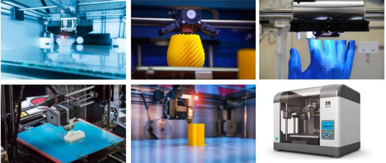
Figure 2 - 3D Printing.

In conclusion, 3D printing is becoming more popular due to the ability to create rapid prototyping, increase supply chain efficiency, reduction in production costs, and manufacture unique items. In addition, regarding its impact on the environment is important to consider the type of materials used.